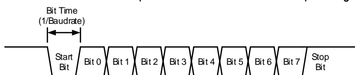
Figure 2: Transmitted byte

The SFA30 sensor has separate RX and TX lines with unipolar logic levels. A transmitted byte looks as in Figure 2.